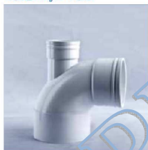
90 Degree Reducing Bend MF, 2" Vent