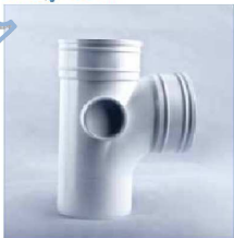
90 Degree Single Sweep Tee MF