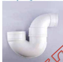
1/2" Trap Body Set 4" x 3"