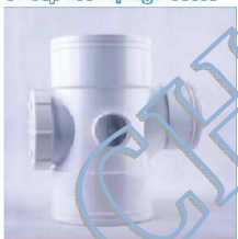
90 Degree Reducing Sweep Tee FF, Big Access