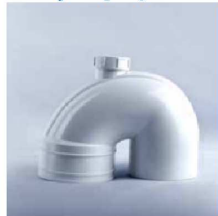
1/2" Trap Body MF, IO