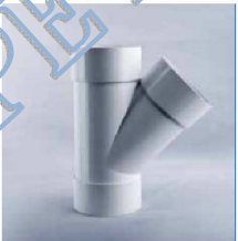
45 Degree Y-Tee