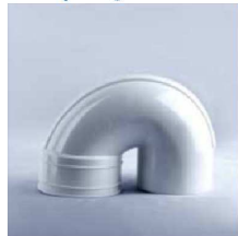
1/2" Trap Body MF