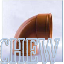
90 Degree Underground Bend FF