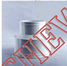
Concentric Tapper FF