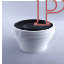
WC Pan Collar 45° Offset