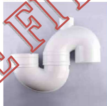
3/4" Trap Body Set with 2" Vent