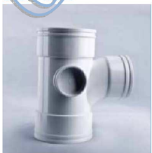
90 Degree Reducing Sweep Tee FF