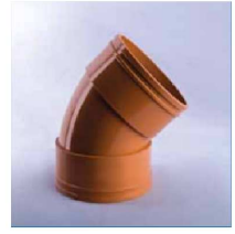
45 Degree Underground Bend FF