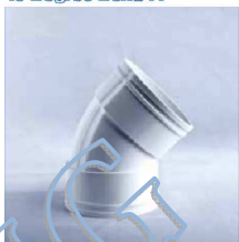
45 Degree Bend FF