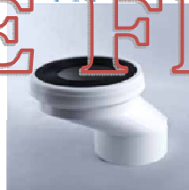
WC Pan Collar 3" Offset (Right)