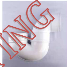
1/2" Trap Body Set