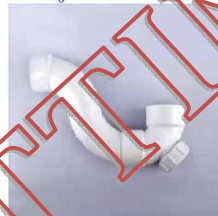
1/2" Trap with IO