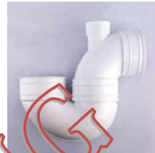
1/2" Trap Body Set with 2" Vent