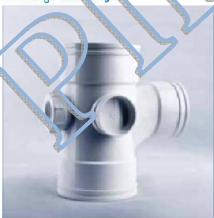
90 Degree Reducing Sweep Tee FF, IO