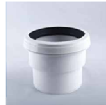
Single Cast Iron Connector MF