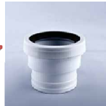
Single Cast Iron Connector FF