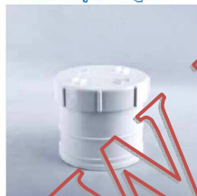
Access Cap & Plug FF