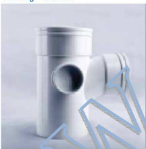
90 Degree Reducing Sweep Tee MF