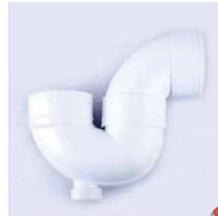
1/2" Trap Body Set With IO