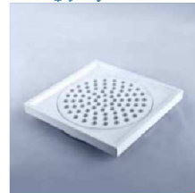
6" Screw Floor Trap Grating (Flat)