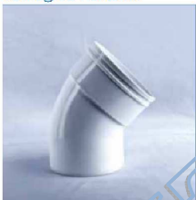
45 Degree Bend MF