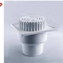
Balcony Outlet, Square Base (Dome)