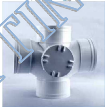
Cross Tee FF, Big Access