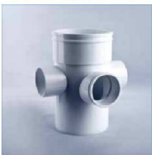
90 Degree Reducing Sweep Tee with 2" Socket Branch MF