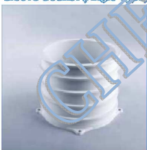
Sleeve Socket (Angle Type)