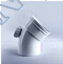
45 Degree Bend MF, IO