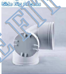
90 Degree Bend FF, Side Big Access