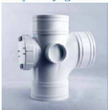
90 Degree Single Sweep Tee FF, Big Access