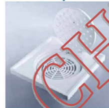
6" Floor Trap Grating with Anti Mosquitoes Filter