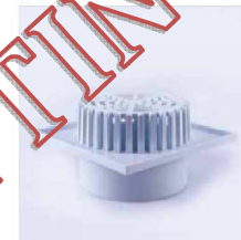
Dome Roof Outlet