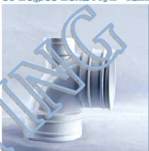
90 Degree Bend FF, 2" Vent