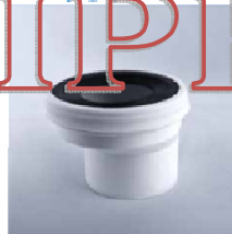
WC Pan Collar 2" Offset (Right)