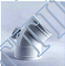
45 Degree Bend FF, IO