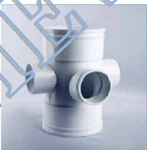
90 Degree Reducing Sweep Tee with 2" Socket Branch FF