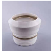
WC Straight Pan Connector