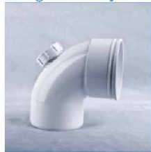
90 Degree Bend MF, IO