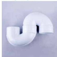
3/4" Trap Body Set