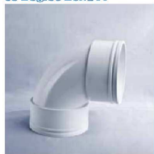
90 Degree Bend FF