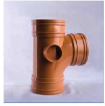
90 Degree Underground Sweep Tee FF