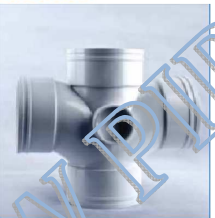
Cross Tee FF