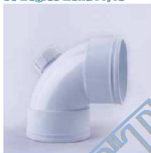
90 Degree Bend FF, IO