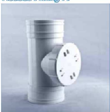
Access Fitting FF