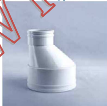
Level Invert Tapper FF