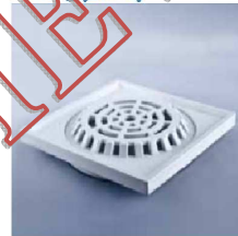
6" Screw Floor Trap Grating (Dome)