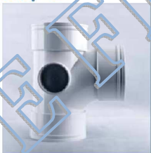
90 Degree Single Sweep Tee FF