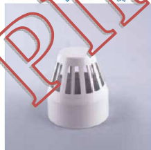
Vent Cowl (Female Type)