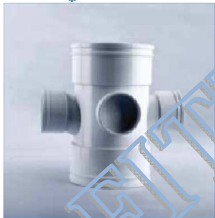
Reducing Cross Tee FF