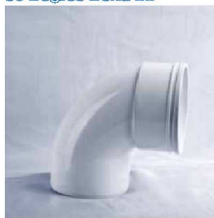
90 Degree Bend MF