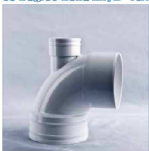
90 Degree Bend MF, 2" Vent