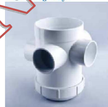
1/2" Gully Trap