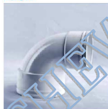
90 Degree Reducing Bend FF