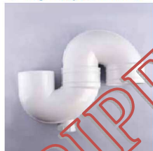
3/4" Trap Body Set with IO