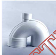
1/2" Trap Body MF, 2" Vent