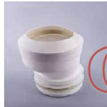
WC Pan Connector 1" Offset