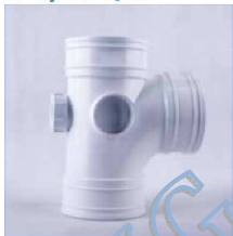
90 Degree Single Sweep Tee FF, IO