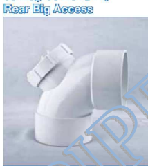
90 Degree Bend FF, Rear Big Access